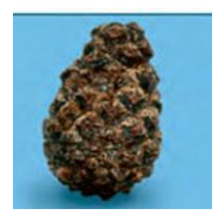
Figure 3:- Pine Cone when Dry

Pine cones on the trees are seemed to be closed but when they fallout from the tree it gets opened to release the seeds. The scales of the pine cone get open as they are made up of two layers of stiff fibers running in different directions. As the cone dries out, the scales inside gets expanded more than outside, causing the outer scales to bend outwards, releasing the seeds inside which is the principle used in the smart fabric.