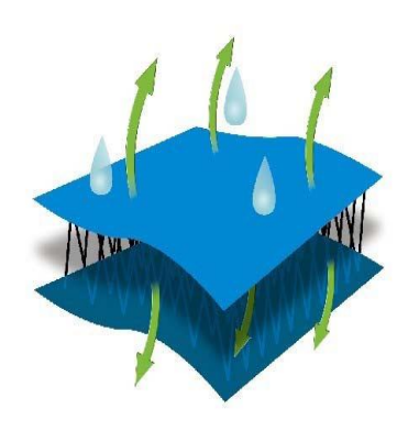
Figure 2:- Structure of spacer fabric

Spacer fabrics are 3D fabrics that comprise of two outer textile substrates that are joined together and kept apart by an insert of spacer yarns, mostly monofilaments. This creates a ventilated layer of air, allowing heat and moisture to escape. One reason for development of spacer fabrics was an attempt to replace toxic, laminated-layer foam with a single, synthetic fibre type fabric, thus facilitating future re-cycling. An important advantage is the low weight in proportion to the large volume. The application areas of spacer fabric are unlimited ranging from healthcare, safety, military, automotive, aviation and fashion. Currently it is being largely used for functional clothing comprising sports shoes, bra cups, shoulder pads, knee and elbow protectors etc.