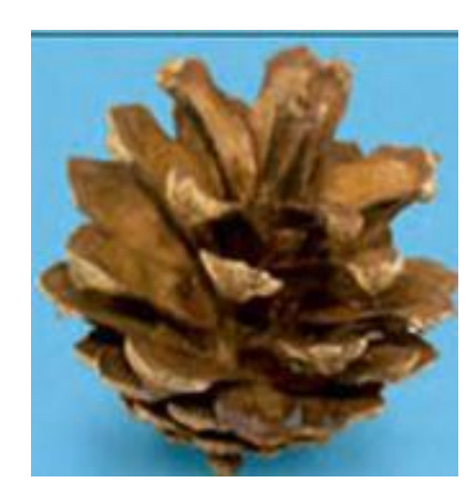
Figure 4:- Pine Cone when Damp